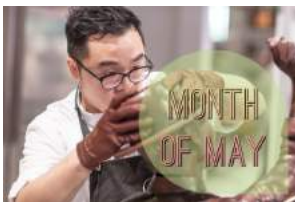
Month of May 4th May 2016