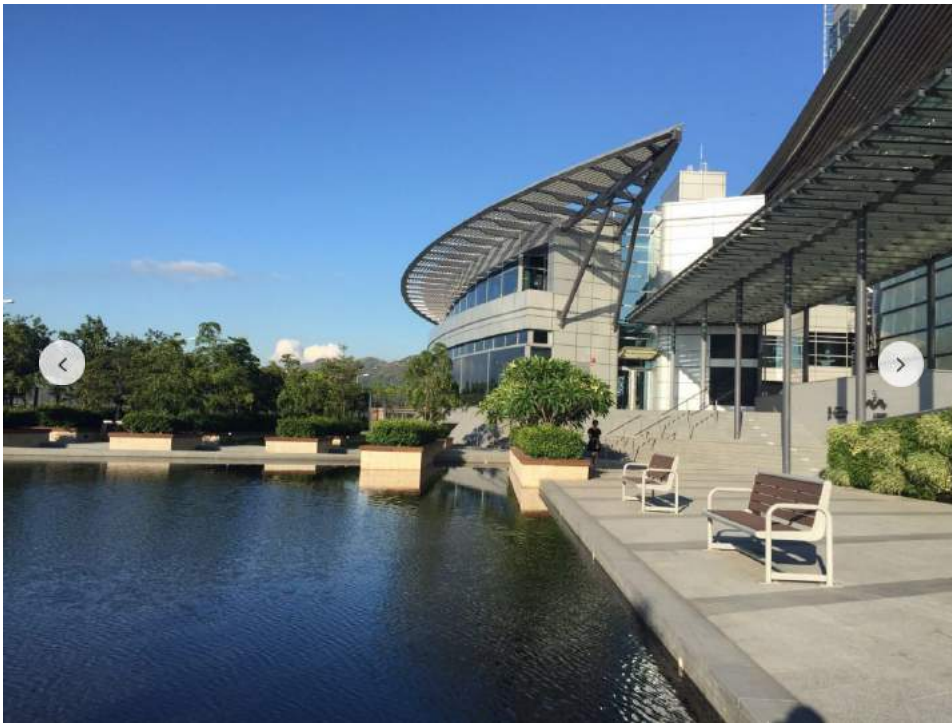
Hong Kong produces 1,200 tonnes of sludge each day, but finally finds a solution to this waste issue – T-PARK.

'T' for 'transformation', T-PARK is one of the world's most technologically advanced facilities of its kind – and it's situated next to our homes in Tsang Tsui, Tuen Mun. As you read this, the sludge treatment facility initiated by the Environmental Protection Department Hong Kong is busy transforming Hong Kong's sewage waste into reusable energy through the use of advanced incinerating technology. Post-incinerated sludge is converted into ash and residue, which equates to a whopping 90% reduction of the original volume normally disposed into the landfills.