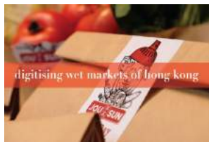
Digitising Wet Markets of Hong Kong 6th May 2016