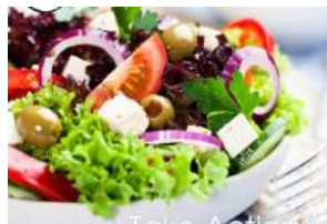
Step Up to the Plate: Restaurants to Dine at for a Good Cause 18th April 2016